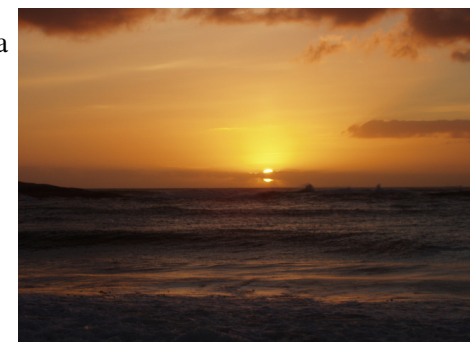
Photos: Left: A fellow SIM worker, Allie Smith, visiting Victoria Falls. Center: Three very special little friends, celebrating birthdays. Right: An amazing sunset on the beach in Cape Town.